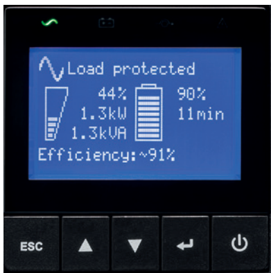
9SX graphical LCD