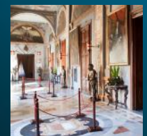
Museums & Galleries

For technical specs, see the manual via the TexecomPro mobile app. Visit pro.texe.com for more info.